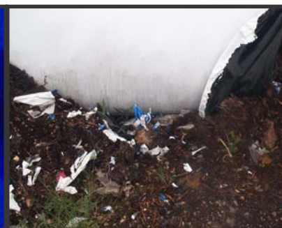
Plastic Contaminating Compost